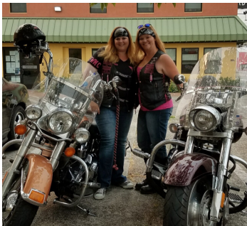
Femme Fatales Group Ride collected donations for clients seeking our services