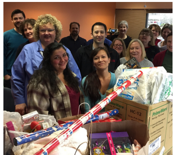
WFSE collects supplies during the holidays for survivors staying at our shelter