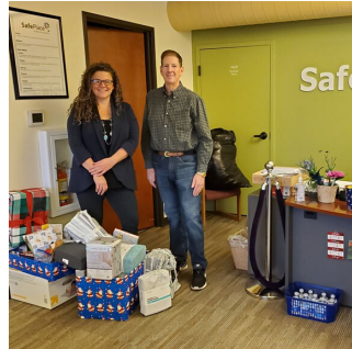
Calcara Family Chiropractic hosts an annual Patient Appreciation Day