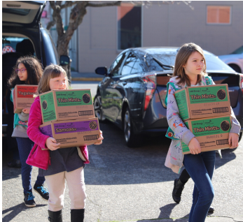
A Girl Scout Troop donated extra cookies as treats for clients