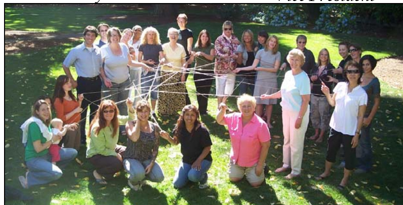
SafePlace staff & volunteers, Sept 2008