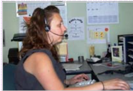
Answering crisis calls 24 hours a day