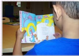
Reading in our children's play room